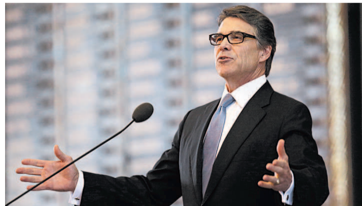
Gov. Rick Perry in his farewell speech to legislators Thursday.

"Governor Perry has accomplished some notable things that have promoted economic growth, but he has not created a sustain- Continued on Page A18